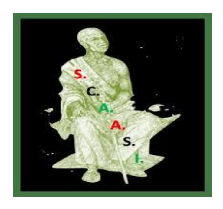
Southern Conference on African American Studies, Incorporated (SCAASI)